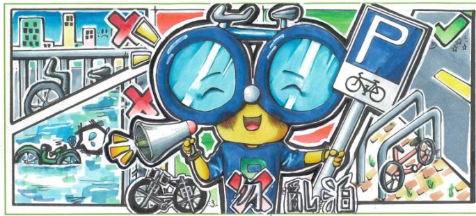
高級組 (1) 及 (2) Senior Group (1) & (2)

註：請在上面的方格中填入你的橫額連標語設計。設計必需包含本比賽指定吉祥物——「泊仔」的面孔並配以你自由創作 / 設計的任何動作及表情形式。你可以參考本比賽章程及參賽表格中印附的「泊仔」圖像。 Note: Please enter your banner design with slogan in the box above. The design should include the face of the mascot for the Competition – 'Pak Cha' in whatever action form/ facial expression in your own design/ creation. Please make reference to the image of 'Pak Cha' in this Competition Regulations and Student Entry Form.