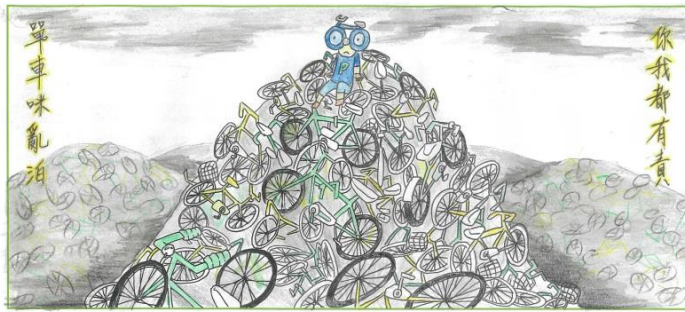
高級組 (1) 及 (2) Senior Group (1) & (2)

註：請在上面的方格中填入你的橫額連標語設計。設計必需包含本比賽指定吉祥物——「泊仔」的面孔並配以你自由創作 / 設計的任何動作及表情形式。你可以參考本比賽章程及參賽表格中印附的「泊仔」圖像。 Note: Please enter your banner design with slogan in the box above. The design should include the face of the mascot for the Competition – 'Pak Cha' in whatever action form/ facial expression in your own design/ creation. Please make reference to the image of 'Pak Cha' in this Competition Regulations and Student Entry Form.