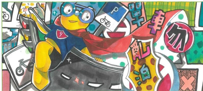
高級組 (1) 及 (2) Senior Group (1) & (2)

註：請在上面的方格中填入你的橫額連標語設計。設計必需包含本比賽指定吉祥物——「泊仔」的面孔並配以你自由創作 / 設計的任何動作及表情形式。你可以參考本比賽章程及參賽表格中印附的「泊仔」圖像。 Note: Please enter your banner design with slogan in the box above. The design should include the face of the mascot for the Competition – 'Pak Cha' in whatever action form/ facial expression in your own design/ creation. Please make reference to the image of 'Pak Cha' in this Competition Regulations and Student Entry Form.