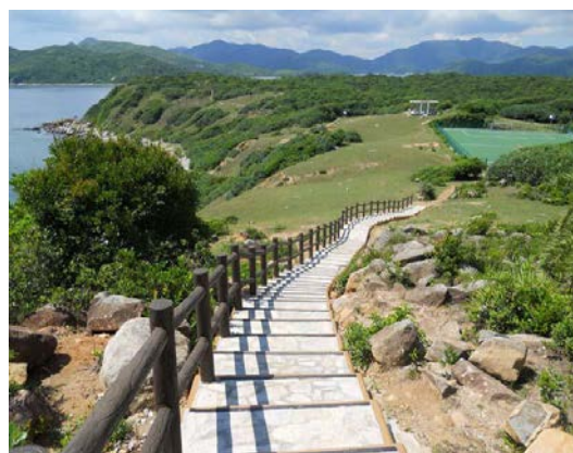
Using natural stones for paving a country trail in Tap Mun, Sai Kung North, Tai Po