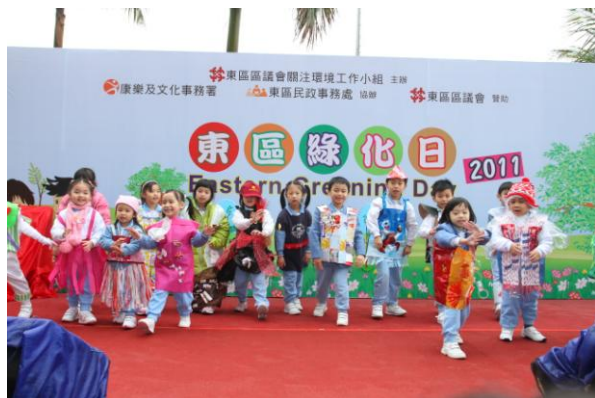
Eastern Greening Day 2011 organised by Eastern District Council and Eastern District Office

8. Apart from our green initiatives in local environment improvement projects, we continue to encourage greening at district level by organising a number of community involvement activities with participation of all sectors of the community, such as tree planting days, workshops on energy saving measures, greening carnivals, green tours, exhibitions, competitions and programmes on source separation of waste, etc.