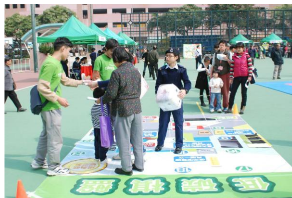
"Low Carbon Living" Carnival organised by Yau Tsim Mong District Council and Yau Tsim Mong District Office