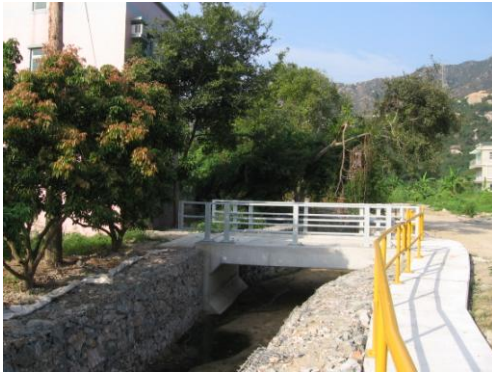
Use of natural stones for the construction of gabion wall as embankment adjacent to a stream at Lung Kwu Tan, Tuen Mun

7. HAD carries out minor local improvement works with a view to upgrading the infrastructure and improving the quality of local environment. In support of environmental protection, we include appropriate environmental pollution control clauses in all works contracts. We pay much emphasis on designing our works projects carefully so as to minimize possible impacts on the natural environment and encourage the use of environmentally friendly materials in our minor works projects, e.g. using natural stones for the construction of gabion wall as embankment. We also implemented a project on utilization of solar energy for the pumping and lighting system of a water tank.