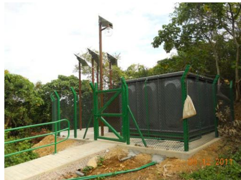
Provision of solar light system for a water tank at Chau Mei, Sai Kung North, Tai Po