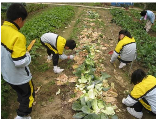
“Green Ambassador Training Scheme Stage II” organised by Sham Shui Po District Council

8. Apart from our green initiatives in local environment improvement projects, we continue to encourage greening at district level by organising a number of community involvement activities with participation of all sectors of the community, such as eco-life sharing sessions, green ambassador training programmes, greening carnivals, green tours, exhibitions, competitions and programmes on food waste recycling, etc.