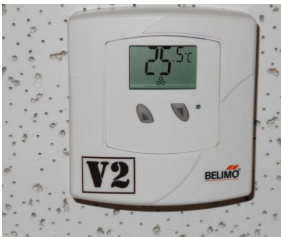
Maintaining air-conditioned room temperature at 25.5°C