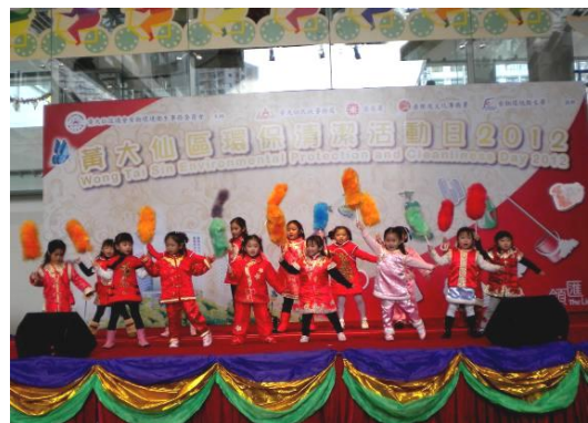
“Wong Tai Sin Environmental Protection and Cleanliness Day” organised by Wong Tai Sin District Council and Wong Tai Sin District Office