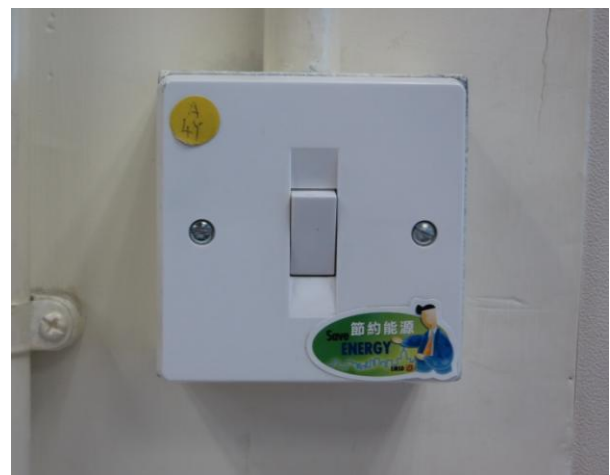
Affixing "Save Energy" stickers near the switches